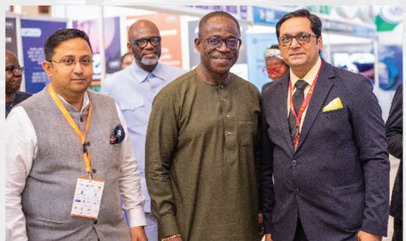
INTERACTION WITH EXHIBITORS