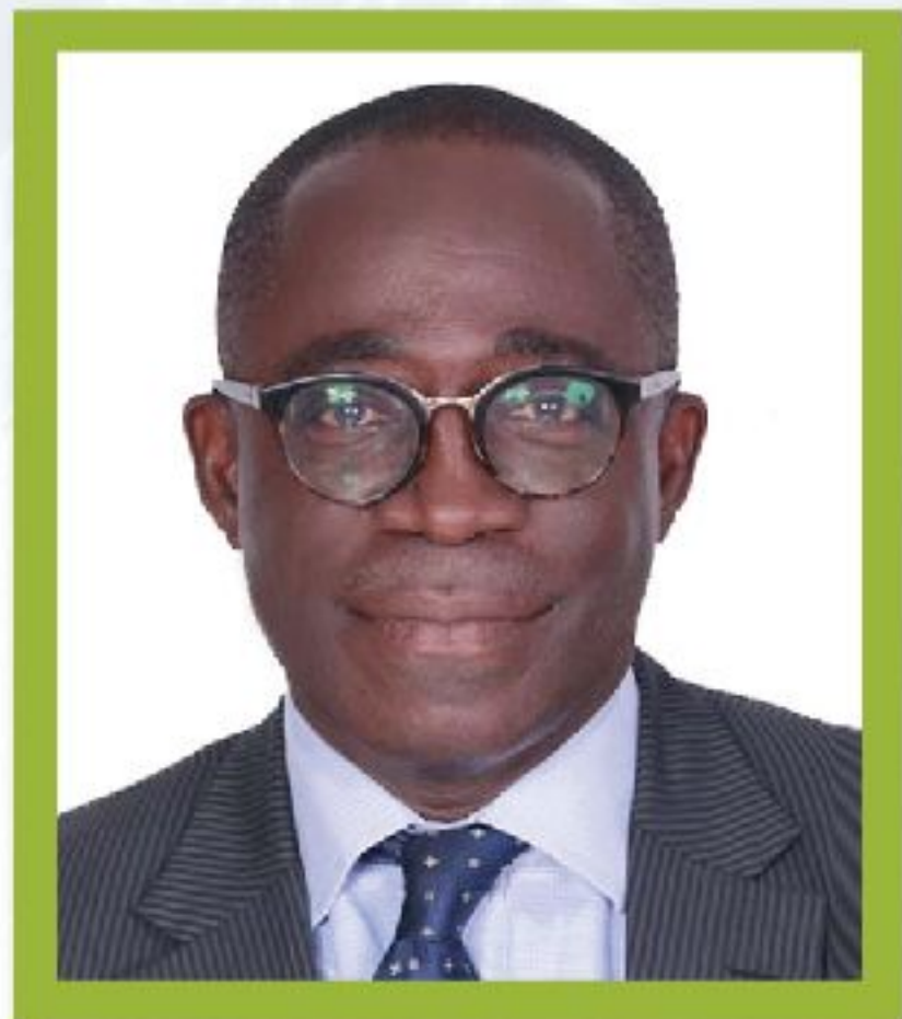
Hon. WILLIAM OWURAKU AIDOO Deputy Minister, Ministry of Energy

The Deputy Minister Hon Owuraku , in his inaugural address welcomed both the exhibitors and visitors in the industry highlighting it is the right time of partnership between the international electrical and power solution providers especially from India Turkey and Middle east who exhibited and Ghanaian business and trading community by the way of taking and using the opportunity on account of the African Continental Free Trade Area (AfCFTA) and improving the infrastructure with advancement of adoption of new power and electrical solutions, especially the renewable energy and power conservation solutions.