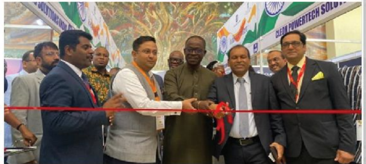
More than 60 businesses in the power, energy, electrical and engineering sector have converged on Accra for the annual power, energy and technological exhibition.